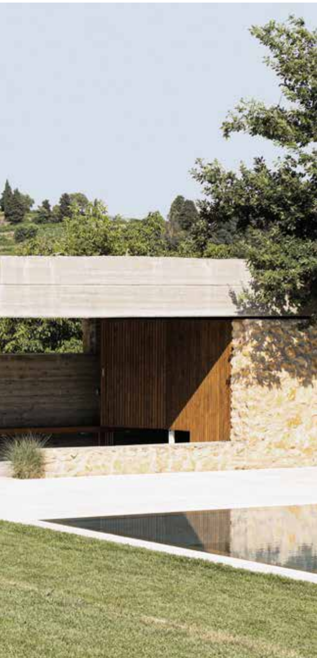
Il Brolo della Cantina Gorgo Winery, Custoza, Italy Architect: Bricolo Falsarella