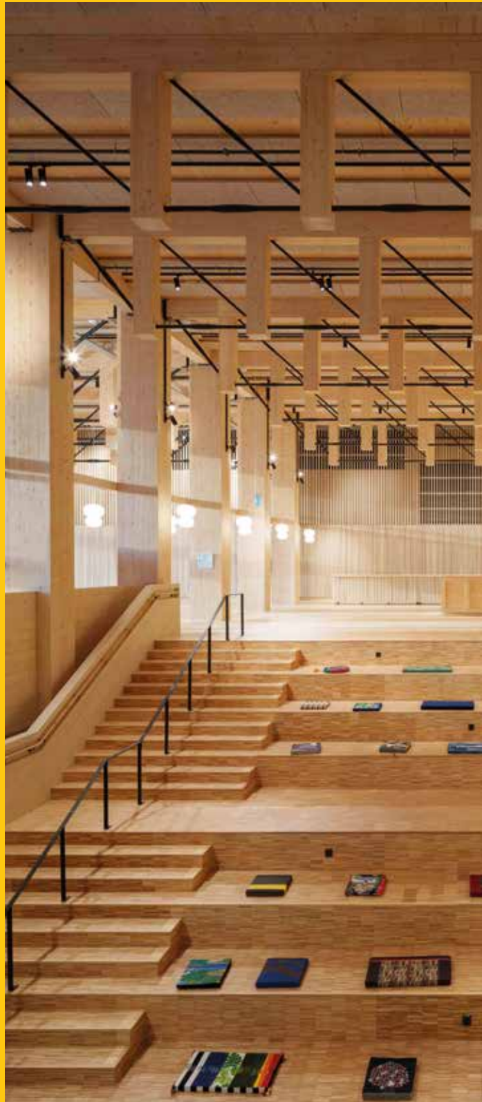
Sara Cultural Centre, Skellefteå, Sweden Architect: White Arkitekter