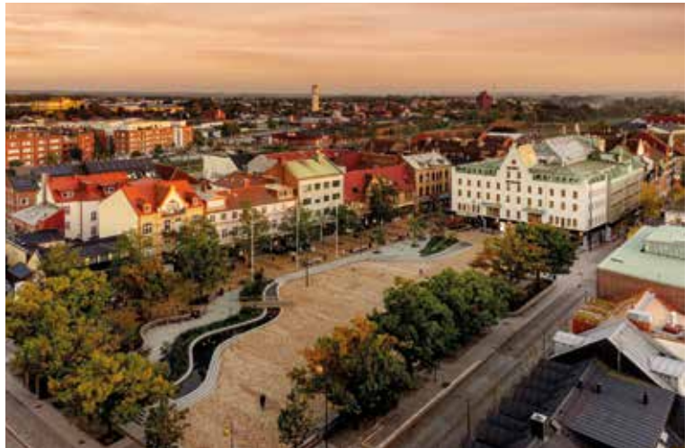
Stora Torg, Eslöv, Suède Architecte : Sydväst architecture and landscape