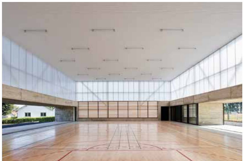
Covered Sports Ground, Palinges, France Architects: Burlat & Vega Architectes

Architects are agents of change and their offices are competence units. In this spirit I wish all of us the best of success for the next year and to further develop our activities together.