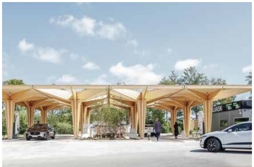
Ultra Fast Charging Station for Electric Vehicles, Fredericia, Denmark Architects: COBE

The most visited webpages are the ACE homepage (#1), Access to the profession (#2), International jobs in Europe (#3), Architects in Europe (#4) and the ACE 2020 Sector study (#5).