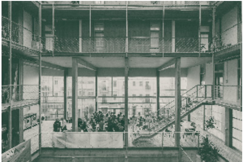
La Borda - Logement Coopératif, Spain Architects: Lacol