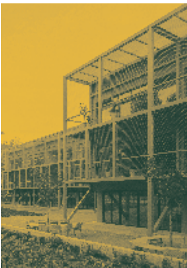
Scuola Enrico Fermi, Turin, Italy Architects: BDR bureau

Where design contests are restricted to a limited number of participants, the contracting authorities shall lay down clear and non-discriminatory selection criteria. In any event, the number of candidates invited to participate shall be sufficient to ensure genuine competition.”